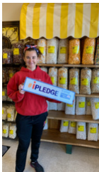
Sweet Harvest Popcorn