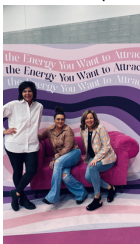
Valencia Salon & Spa Valencia Boutique