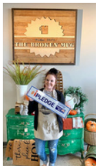
The Broken Mug

Thank you to the following iPLEDGE members for helping raise dollars and awareness of Columbus Area United Way. iPLEDGE provides the opportunity to use a business or service as a mechanism for impact and change. In partnership for their dedication and community support CAUW features the business or service through various means of social media, e-newsletter promotions, and other publications. It is as simple as saying "YES – iPLEDGE!"