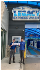
Legacy Express Wash