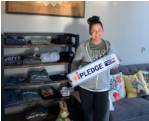
The Broken Mug