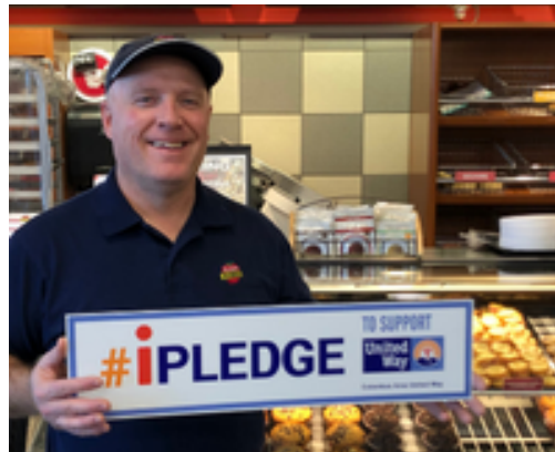
Big Apple Bagels