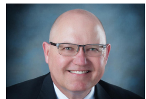
Al Starzec BD Medical