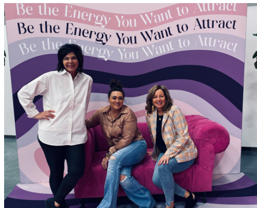
Valencia Salon & Spa Valencia Boutique