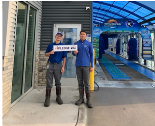
Legacy Express Wash